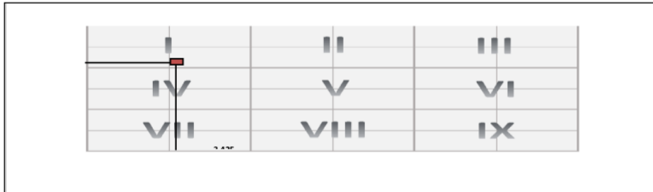
Picture 1. IE Matrix Calculation Result

Source: Post-processed Primary Data, (2020)